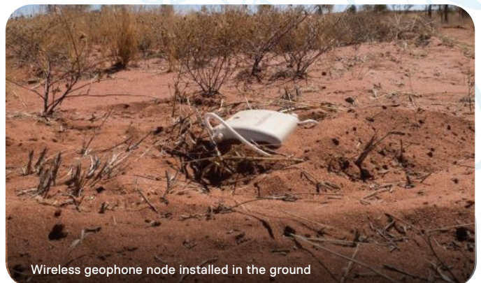
Wireless geophone node installed in the ground