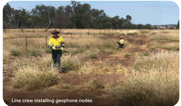
Line crew installing geophone nodes