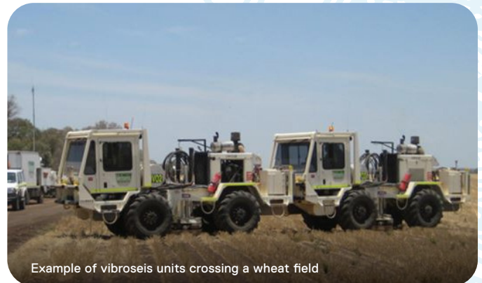
Example of vibroseis units crossing a wheat field